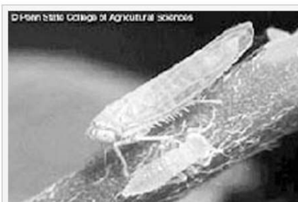
Potato leafhopper adult and nymph

Potato leafhopper (PLH) has been one topic of study as well as a conspicuous pest in potatoes at the Hampshire College farm. PLH in general arrives on winds from the south in summer, and while feeding it introduces a toxin to the plant that can cause the spectacular withering and blackening of potato plants called hopperburn ("h-burn") (see Howell et al. 2006, PSU 2004, Tingey and Muka 1983, including web pages and photos) .