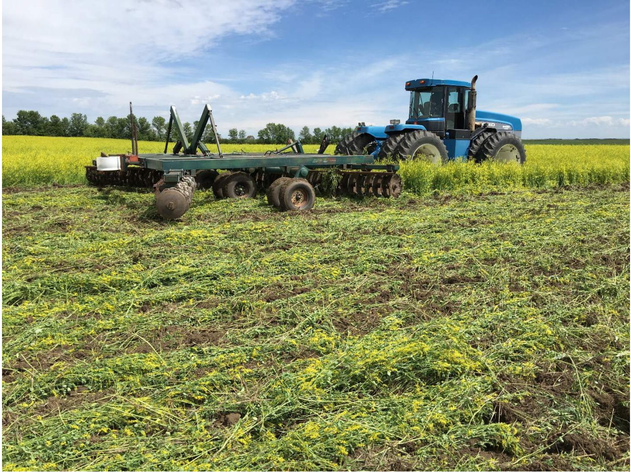
A field of sweet clover being terminated with a disc in Southern Saskatchewan, summer 2017.