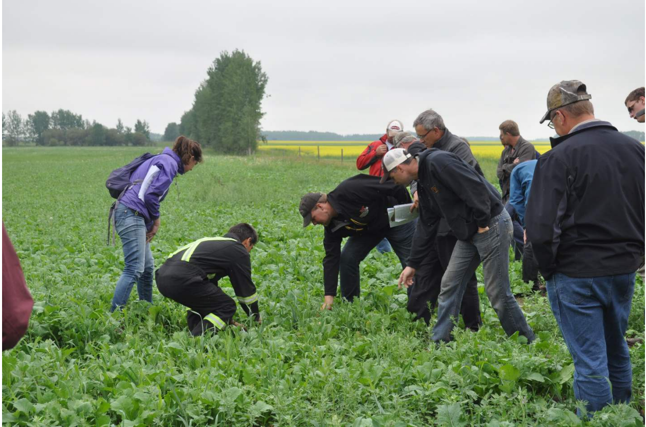
Demonstrating the Green Manure Bioassay to farmers at a field day in Northern Alberta in July 2016.