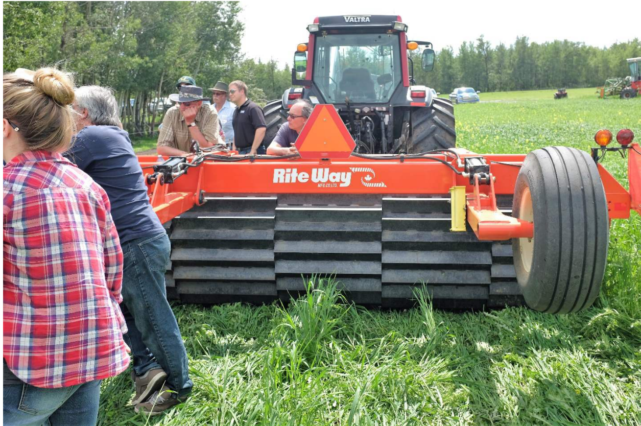
Farmers at a field day in Central Alberta in July 2016. Organic farmers on the Prairies are exploring the use of the roller crimper for managing green manures.