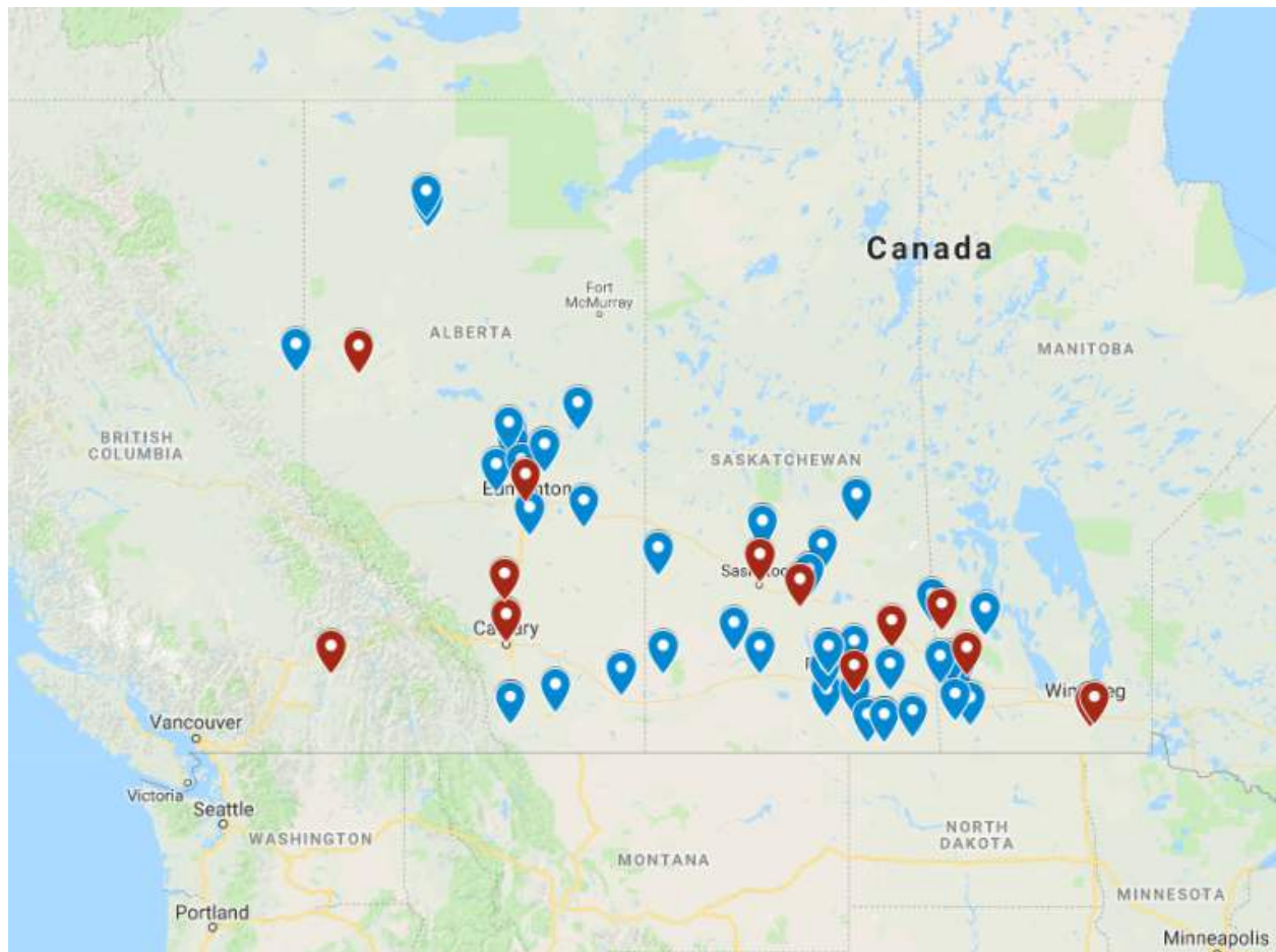
Figure 2. Map of participants in the Nutrient Management Program, fifty-two farms (blue dots) and fourteen agronomists (red dots).

do have some information there, and can find some common themes (which will be discussed in the Results section).