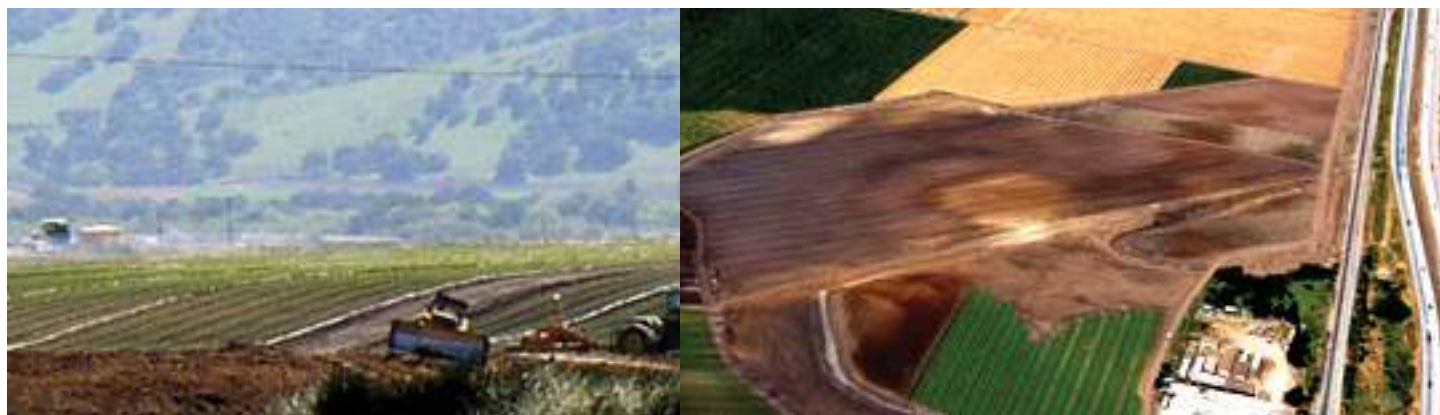
Bulldozing a twenty-acre lake (left) near Salinas, CA to keep food safety auditors happy cost the farmer plenty to carry out. Now it is costing more with water agencies requiring that the denuded lake (right) be restored.

As understanding has increased regarding the prevalence of pathogens in wildlife and the pathways by which pathogens may move, it has become clear that the initial measures taken following the outbreak should be reconsidered. The concerns regarding wildlife created by some food safety metrics have been hard to dispel. At times they have led to the rigid application of conservation-threatening metrics in crops that present minimal to no food safety risk. Such a misguided focus on wildlife in food safety regulation has led to the removal of conservation measures that could actually benefit food safety, with little thought to the ecosystem services and public health benefits these features provide.