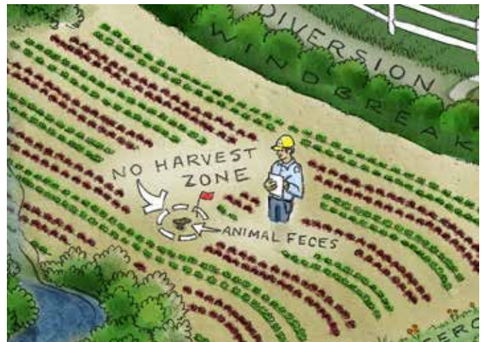
Periodically monitoring for animal damage or feces in the production field ensures a safe harvest.