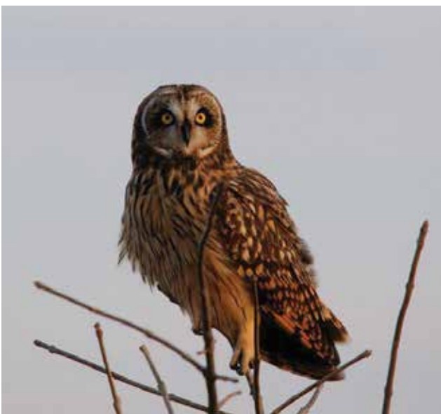
Vern Wilkins, Indiana University, Bugwood

Seeing wildlife in habitat is usually good, since the habitat is often planted or conserved to support pollinators, migrating predators that eat rodents and other types of wildlife. There is only a potential for a problem when and if wildlife enter a field and damage the crop, and/or leave feces behind that can contaminate the crop. Monitoring the production field next to the habitat for damage and feces can help determine if the