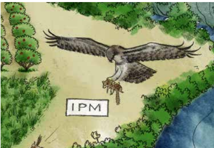
Beneficial natural processes, such as Integrated Pest Management (IPM), help to control rodents.

It is highly unlikely that farmers would ever intentionally sell contaminated produce. In the past, it was long held that common sense approaches were sufficient to ensure produce did not have food-borne pathogens. Animals were discouraged from production areas because they damaged crops. The potential for animal manures applied as fertilizers and soil amendments to result in water and crop contamination with human pathogens was well recognized. However, in 2006, everything changed when an outbreak of E. coli O157:H7 was traced back to a farm on California's Central coast, the center of the state's fresh-cut salad industry. While it was never unequivocally determined how the spinach became contaminated, non-native feral pigs, contaminated irrigation water, and adjacent cattle operations were all considered as possible sources. All wildlife and the habitat they occupied became scrutinized by public health, academia, and especially the leafy greens industry.