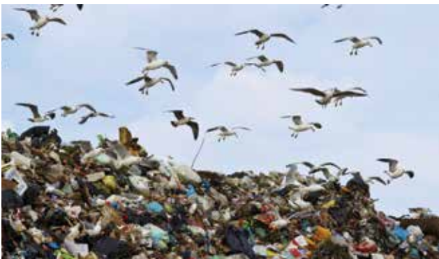
Wildlife living near areas with high levels of pathogens, such as these landfill-dwelling seagulls, may pose a greater risk of transferring pathogens than wildlife not associated with such areas.

Native Wildlife Pose a Low Risk of Carrying Human Pathogens Thus far, studies have shown that native wildlife have a low prevalence of carrying pathogens that cause human illness. The risk of extensive crop contamination from wildlife is small; however, it will never be zero. Within a given population, the number of individual wildlife carrying pathogens, such as E. coli O157:H7 or Salmonella , is generally less than three percent, based on the fairly limited snapshots of research around the country and the world.