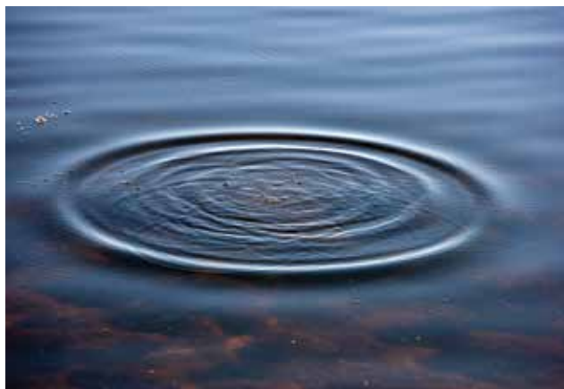
Clear water allows UV radiation from the sun to enter the water, which helps kill off pathogens.

When UV radiation is allowed to penetrate clear water, pathogens won't survive long. If there is sediment in the water or nutrients causing algal blooms, UV radiation isn't as effective. Proactively protect water quality by ensuring irrigation water infiltrates the soil well, and excess fertilizers and eroded soils are not causing pollution and murky water. UV penetration can then effectively foster pathogen reduction.