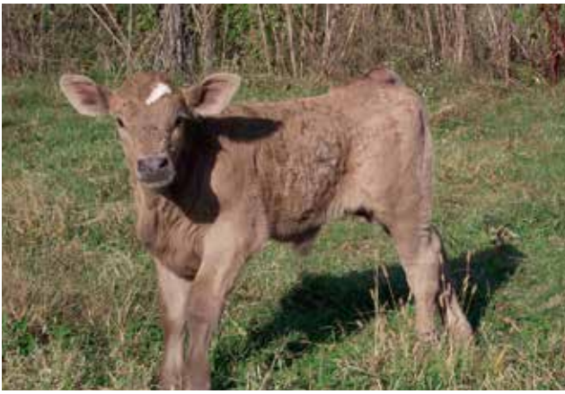
Young livestock are likely to carry higher levels of pathogens than adults.

carries. Young animals tend to carry higher levels of pathogens than adults. Seasonal stress may also result in higher pathogen levels. Cattle, for example, shed more E. coli in their manure during the summer than during the winter. Individual animals can be ‘super-shedders’ in a herd that has an overall low prevalence of shedding.