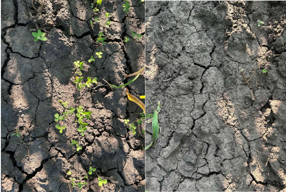
Image 3. Red clover, seeded at the corn V2 stage (left: broadcast and incorporated with flex tine, right: drilled with high clearance grain drill). Pictures taken at 34 days after seeding on site 1 in 2023.