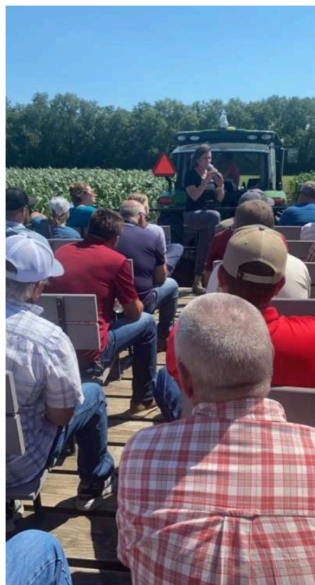
Image 2. Field tour for Minnesota Agriculture Inspectors spotlighting cover crop research in 2022.