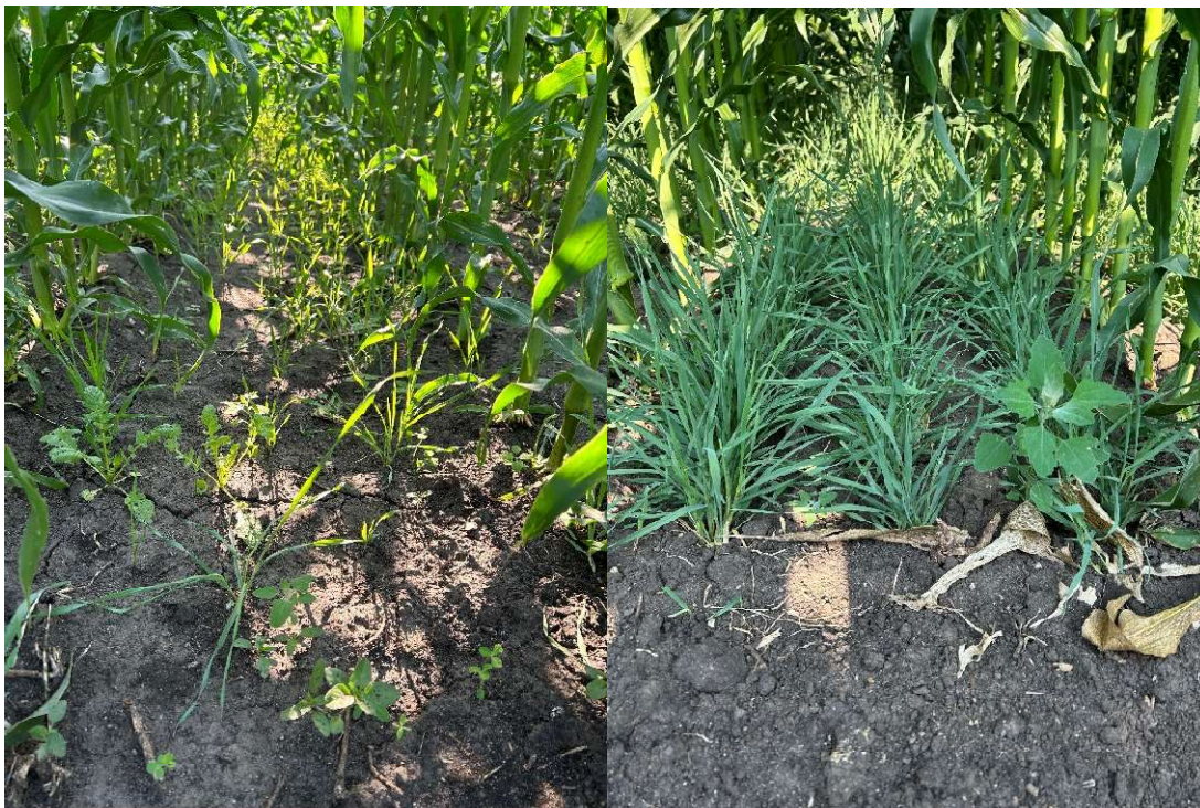
Image 4. Winter rye, seeded at the corn V2 stage (left: broadcast and incorporated with flex tine, right: drilled with high clearance grain drill). Pictures taken at 34 days after seeding on site 1 in 2023.